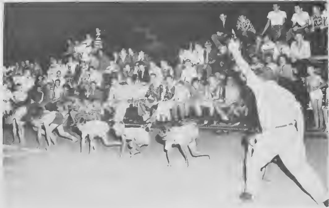
FUTURE Lago High athletes wait for the starter's gun to send them away for a bare-footed, fifty-yard dash toward glory.